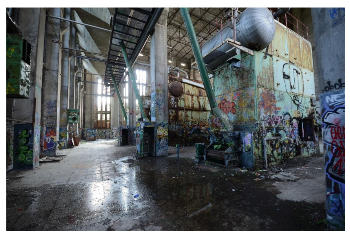
Figure 1: Ruins of the heating plant Munich-Aubing, performance venue of Maya . © Mathis Nitschke.<sup>47</sup>

were even sent a message through their Maya App in a particular section of the piece specifically asking them to use the torchlight-function on their phones to illuminate the main character, who would otherwise have remained in relative obscurity. We literally and figuratively cast a collective spotlight on one aspect of the performance, thus enacting it for us – and others.