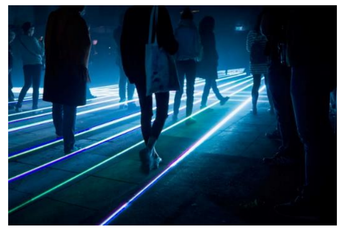
Figure 6: Engaging lasers in Maya. © Julia Hildebrand and Ingolf Hatz.

When a grid of laser beams across the whole space appeared later at ankle height, many of the adults also abandoned their concert audience habitus and played freely with the lasers (Fig. 6): stepping in and out of the grid, blocking individual beams, taking pictures and using their smartphone screens to deflect the lasers to the ceiling or elsewhere.