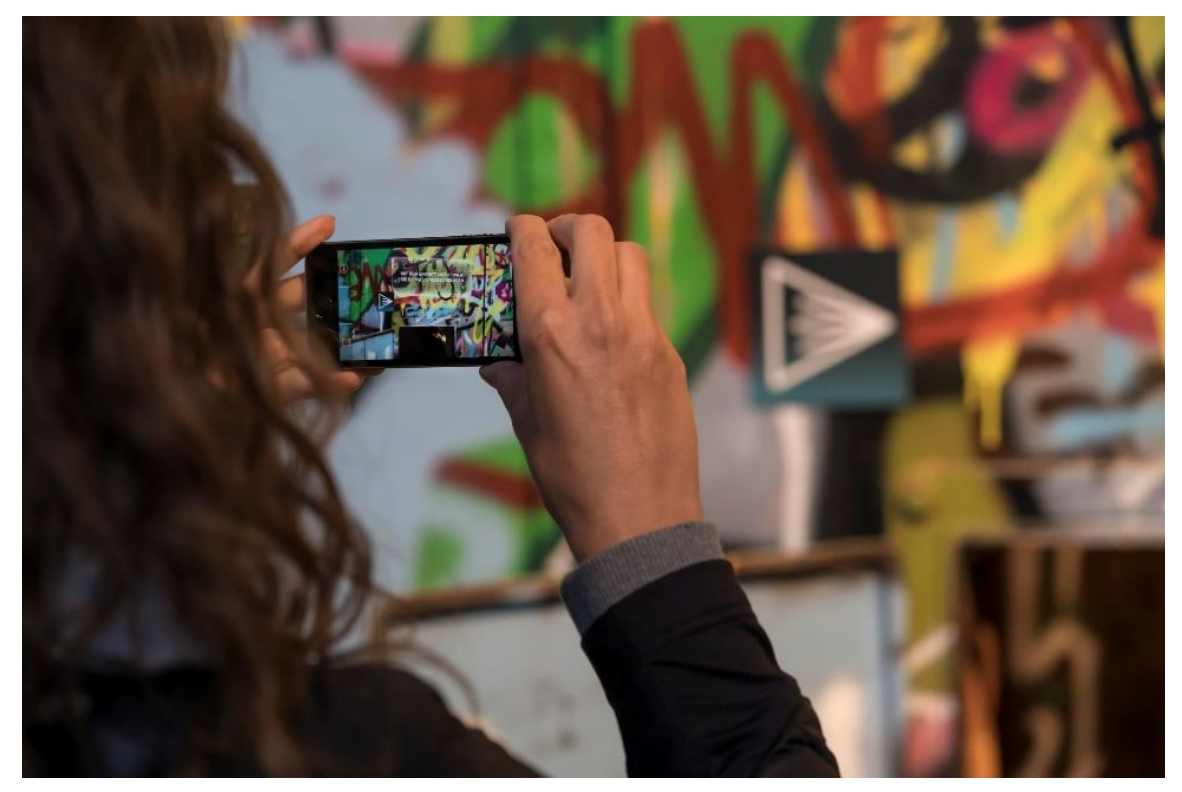
Figure 2: Augmented reality in Maya.