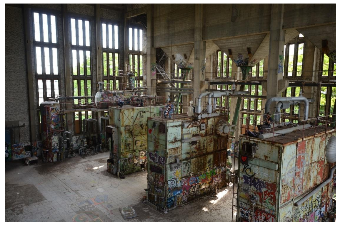
Figure 3: TrioCoriolis in Maya. © Mathis Nitschke.

During the last of these three sections, however, a new 'performer' was introduced: a single laser beam (later followed by several others, designed by Karl-Heinz Käs), which appeared to 'dance' to the music. In the performance I saw it was at first the younger audience members who engaged physically with the laser beam, moving to catch its light, seeking to predict its repetitive movement patterns (Fig. 5).